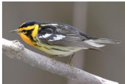
Blackburnian Warbler ( Dendroica fusca ).

His 20 acre property, a part of which borders the Ruitter brook is mostly forest. "I love my woods, which shelter about 15 nesting birds, amongst them the Blackburnian Warbler, in decline in the Appalachian Corridor.