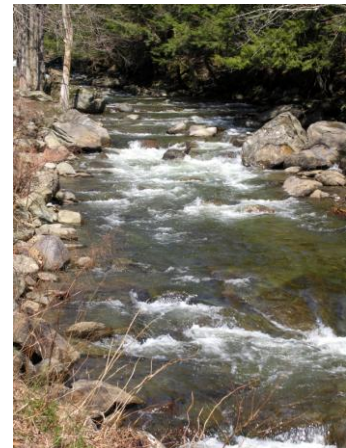
Spring melt in the Ruitter Brook

"Now I know that the beauty and integrity of my land will be maintained."