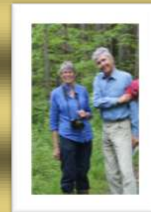
Photos: Landscapes S.Plantenga Trout Lily and photo of Stansje & Guy M.C.Planet